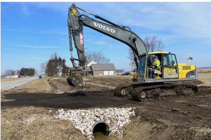
Corunna Rd (Ditch & Johnstone) - Chesaning Twp Ditching & Culvert Replacement