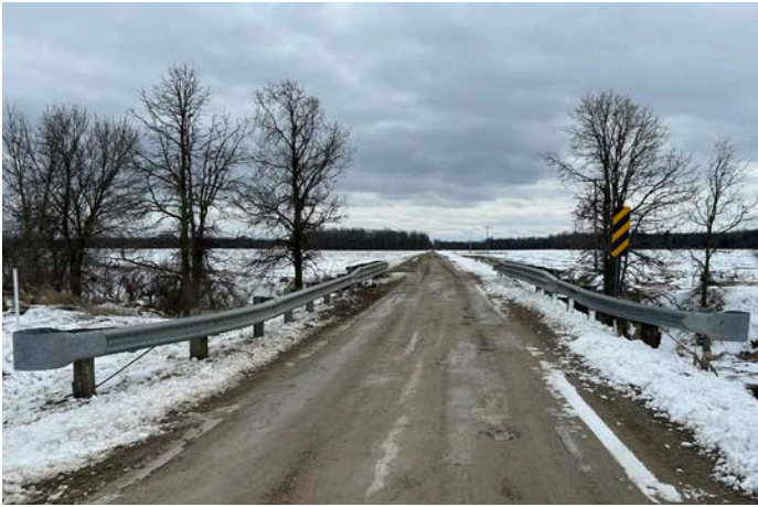
Meridian Rd Bridge - Lakefield Twp Guardrail Replacement