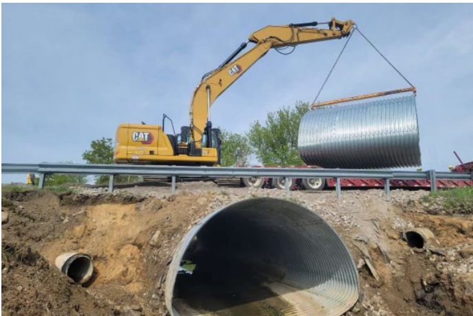
Orr Rd (North of Geddes) - Thomas / Richland Twp Culvert Replacement