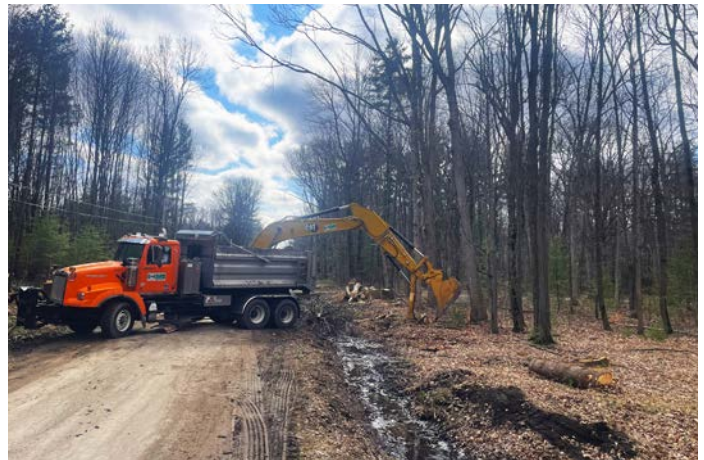
Bell Rd (Birch Run & Burt) - Taymouth Twp Tree Cutting & Trimming