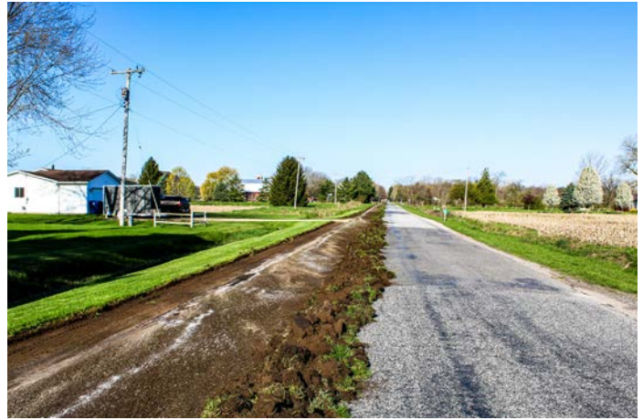
Volkmer Rd (Gasper & Corunna) - Chesaning Twp High Shoulder Removal