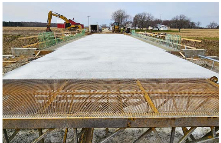
Burt Rd (Over Pine Run) - Taymouth Twp Federally Funded Bridge Project